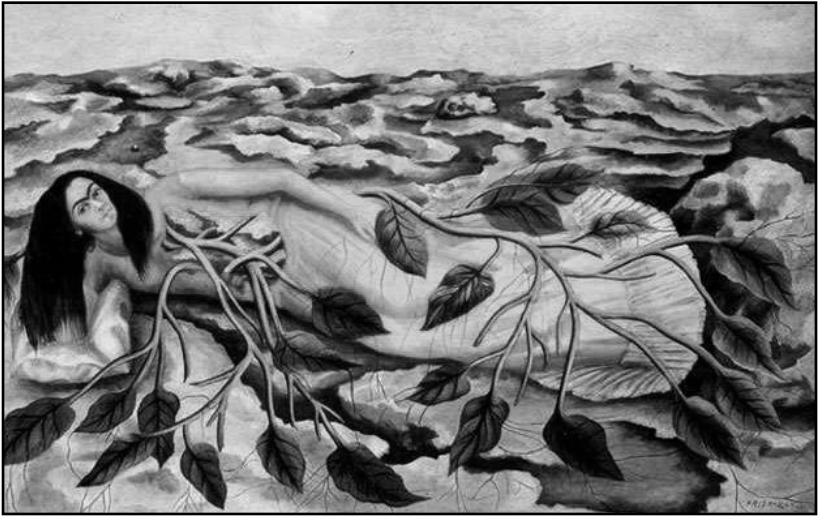
“Roots” by Frida Kahlo - One of her many self-portraits

have sought to universalize her artworks, defining herself primarily as an artist. Yet, she maintained her feminine instincts, grieving her inability to bear children in a series of paintings of fetuses in the womb.