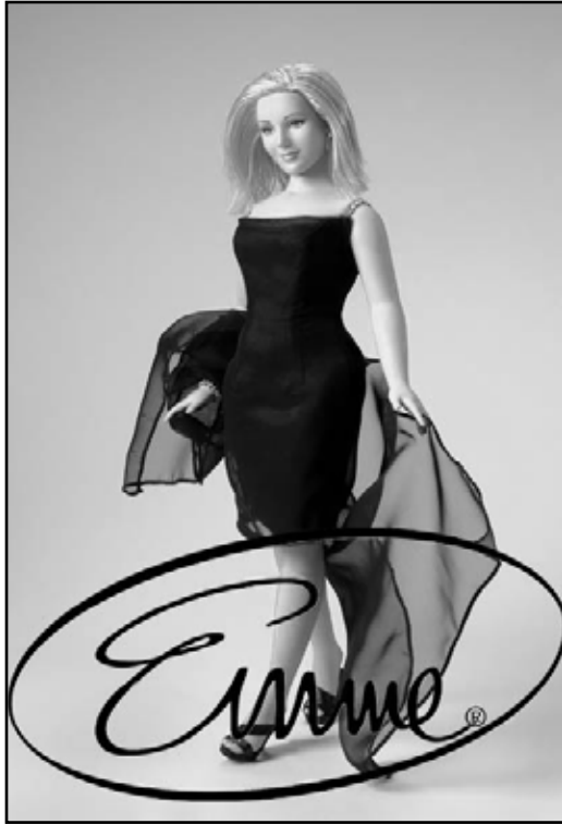
The Emme doll based on plus-size model Emme Aronson

of the spectrum, providing little girls with chubby dolls can also have a negative impact on their health. That is, stuffing your face to be fat is not any better than starving yourself to be skinny.