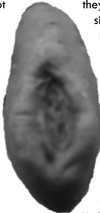
My Cunt Art piece: A Female Potato

Cunt Art deals with all issues pertaining to the female body in general and the cunt in particular. There were depictions of birth, rape, masturbation (which made up most of the paintings), and they were all different but significant in their own way. I tried researching the history of Cunt Art and found very random and very vague articles. So I'm happy that the organizers of this event managed to pull off this event and have a pretty big turnout as well, and have me among the crowd :-D