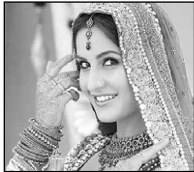
Bollywood star Katrina Kaif

iPod; getting degrees in English and Hebrew Literature; cooking for my friends regardless of what my bank statement says; not wearing a bra; not buying “sanitary napkins” (as if I’m dirty or something); shopping for clothes and shoes because I admittedly enjoy being a consumer; being a cunt-loving goddess; being a lesbian who has a list of men she’d like to date but never would because penises just don’t do it for her anymore; loving aesthetically-pleasing (to my ear) punk/riot grrrrl/ska/any other kind of music; rockin’ out to the Spice Girls; constantly being in and out of tune with God (who has no sex/gender); riding my skateboard; being shy; loving Bollywood; being angry; being so fucking sad that I can’t even move; being so flippin’ happy that I giggle like an insane person on the bus and everyone turns around to see why the fuck I am making so much noise; and anything else I feel like doing, being,