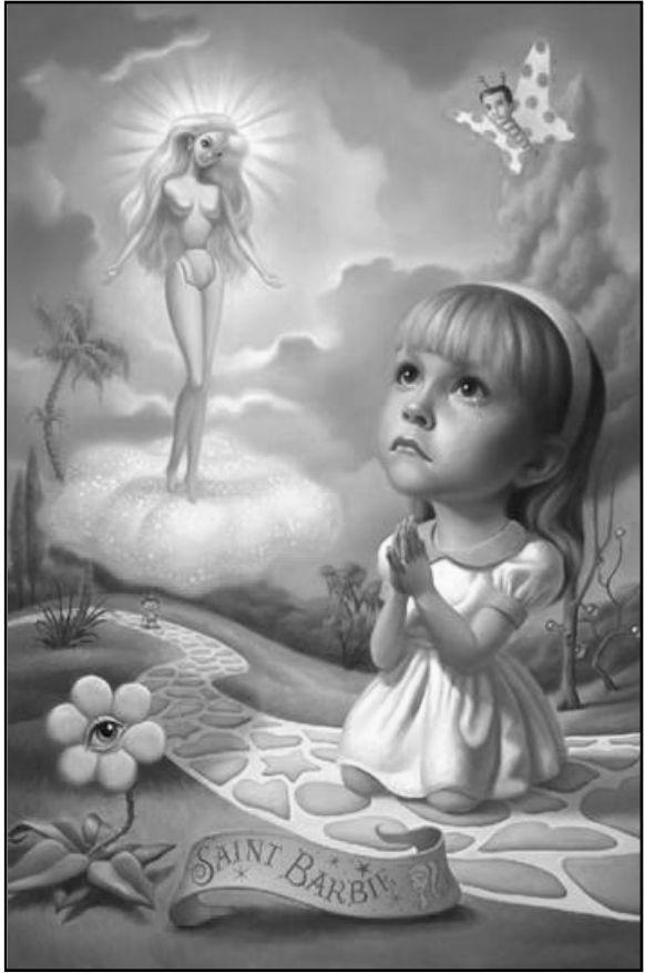
"Saint Barbie" by Mark Ryden

Barbie is the American adaptation of the Bild-Lilli doll, originating in Germany, first appearing as a comic strip. The comic strip presents Lilli as "sassy and ambitious and had no reservations talking about sex. As she had her own job she earned her own money as a secretary but wasn't above hanging out with rich men."