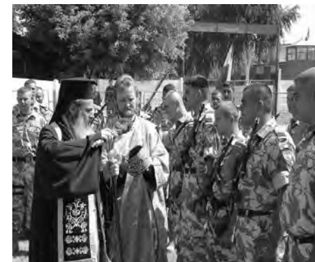
Romanian soldiers being blessed by priests

BOR has justified its position on war, as well as its direct and active involvement and support, by approaching these wars as so-called "Just Wars". This is one of the three positions Christianity has adopted throughout history (the other two are: Pacifism – rarely met, and Holy War – like Crusades for example). The belief in a so-called 'Just War' sustains that some wars, at least, are right because they are perceived to be in the interests of justice. This view says that the aim of Christianity is to promote a world in which peace and justice flourish everywhere: war may sometimes be the tool needed to do this, and waging war may sometimes be a lesser evil (a lesser injustice) than allowing injustice to persist or tolerating the victimisation of innocent people. The idea that violence is not inherently bad can also be seen in some versions of the Just War doctrine - vio-