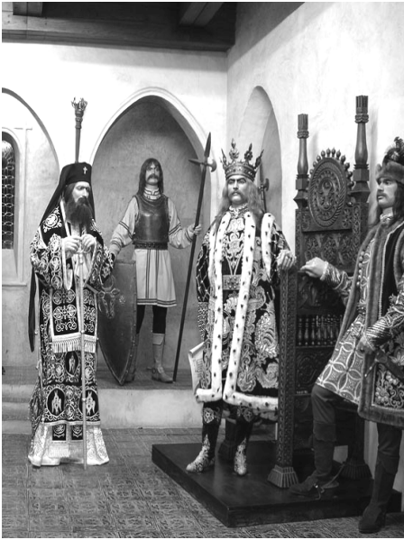
Museum statues of Ștefan cel Mare assisted at his throne by the Orthodox hierarch

thodox identity, a glorification of orthodox-ultra-nationalism.