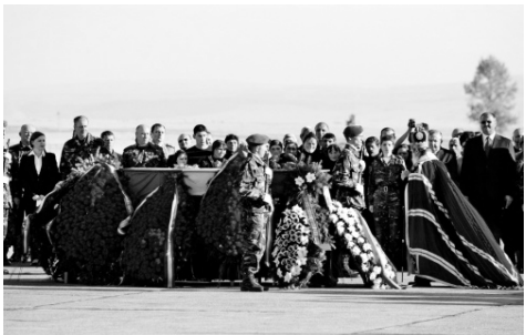
Funeral religious service of a "martyr"

4. This again violates another law, the eight one: „You shall not steal”. It seems that Christian morality preached by the church, is being denied by itself, when the military priests are blessing the soldiers and approving