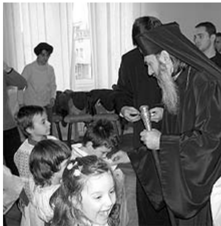
Orthodox propaganda in schools

Presenting biblical myths as plain truths of Universal reality in orthodox terms, is guiding the shaping of children's analytical thinking towards a mystical perception of own person in reference to the whole Universe. A greater abuse is when they are threatened with divine punishment, especially in a metal stage when development is in high correlation with how "fear" is incorporated in the processes of exploring the surrounding world and of building identity and self-image. This is not only to be interpreted only as an inaccurate formative method of education, but more like a neglect of children's rights in having the chance to learn real facts about the world, and not muddled mystical-orthodox fantasy.