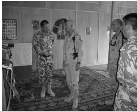
"Little Wooden Church..."

They are ready to face another week, hardly waiting for the next Sunday's religious service."