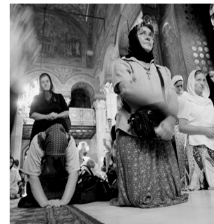
Orthodox women praying in church

applied on her a ritual of exorcism. They bound the young woman with chains on a wooden cross, blocked her mouth with a gag and left her immobilized with no possibility of feeding, hydrating or moving, conditions which lead to her painful death after three days. What the orthodox priest and nuns identified as the devil occupying the young woman's soul were in fact the symptoms of the emotional disorder, the girl had been previously diagnosed with; and the priests were aware of it. The whole village and the rest of the nuns and priests from the monastery have declared solidarity with the murderers and expressed their gratefulness for saving them from the devil. The reaction of the community is alarming, since it is characteristic for the people's blind worshiping of the orthodox church. The church is the one and only authority in the village, it is governing people's lives, not only in the religious way, but it is involved in all the other aspects, it interferes socially, culturally, politically and even economically in the community dynamics. It is even more alarming when you think that the rural population is almost half of the Romanian population (45.1%). Eventually the priest was convicted for 14 years of jail. In his defense the lawyer of the priest has used arguments such as: exorcism is a wide spread practice all over the country and similar rituals of exorcism are happening all the time with the approval and guidance of BOR.