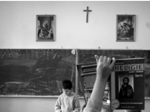
Typical Romanian classroom and a religion textbook

Incrimination of other religions: "Yoga is the direct work of demons" While the Catholic Church is accused of "bringing discord in Transylvania (North-West of Romania) Romanian peoples' faith and has had major consequences, reasoning into an establishment of a misunderstanding climate and mutual distrust, with long-term effects." - Textbook for tenth grade