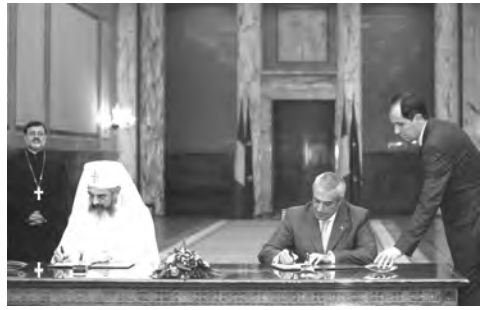
Prime-Minister and Patriarch signing contracts

✦ building up hundreds of education establishments (many of them for children with special needs), churches, workers' and students' restaurants, hospitals (all these under the patronage of the orthodox church),