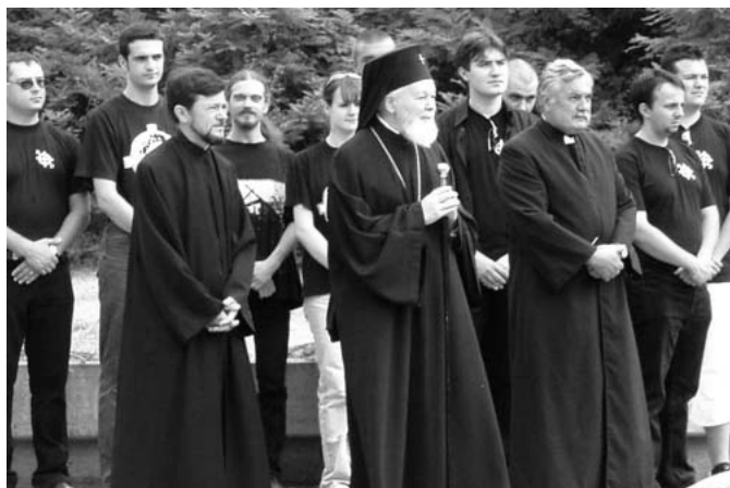
Orthodox priests and Noua Dreapta

The discourse of BOR is an overtly ultra-nationalistic, anti-Semitic, xenophobic, chauvinistic, racist, homophobic one, and at present it is one of the most popular propagandistic instruments for spreading these extremist attitudes and sentiments.