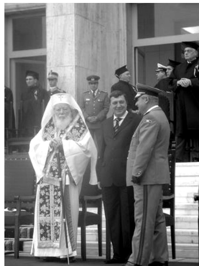
Patriarch Teoctist and army leaders at a national ceremony