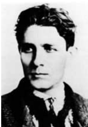
Corneliu Zelea Codreanu

In 1930 Codreanu formed the Iron Guard as a paramilitary branch of the Legion. The Iron Guard was one of the most unusual fascist movement in the interwar Europe due to their delirious religiosity and the fact that it was based on peasantry and students. In 1938 Codreanu was imprisoned and assassinated by the Gendarmerie. His successor Horia Sima (who took over the leadership of the Iron Guard after a long period of inner