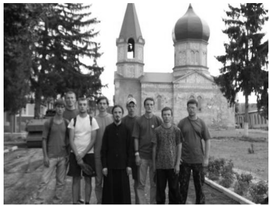
Legionnaires and monk in a summer working camp at monastery

with the one used by interwar Iron Guard, using marches with religious invocations and patriotic hymns, volunteer working camps, charitable campaigns, pilgrimages and religious rituals to different orthodox monuments and halidoms. It is officially known that orthodox halidoms (churches, monasteries) are used by right winged groups and organizations for their manifestations and gatherings, especially