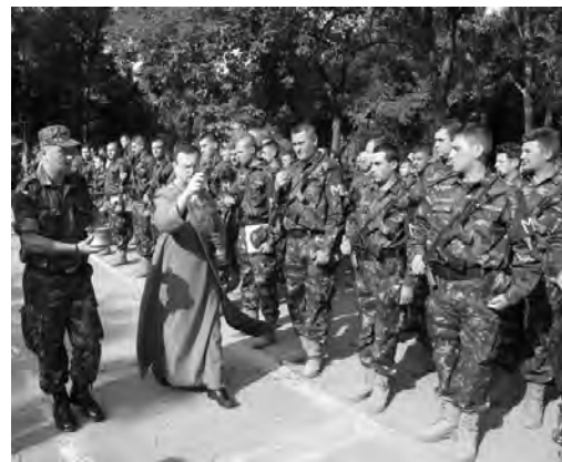
Military orthodox priest

The military clergymen's role is to provide what they call moral and spiritual support for military stuff. By moral support they mean a sort of psychological support, approaching confessing as therapy; spiritual support of course meaning religious support (like absolving their sins). Thus they are explaining their presence in the battle field as a sine qua non presence,