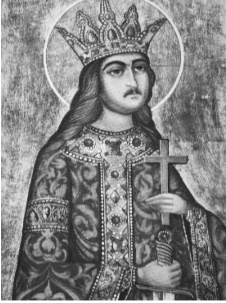
Icon of Ștefan cel Mare

Church is responsible for most of atrocities in the history. Gospel is the poison they are using on harmless and innocent people and their priests are the butchers. When Church meets the greed and the slyness of the greatest political and economical powers on earth these days, the eyesores coming out of this sick alliance are hard to imagine, since the vast majority of world's population have no clue about how the war really looks and feels like !!