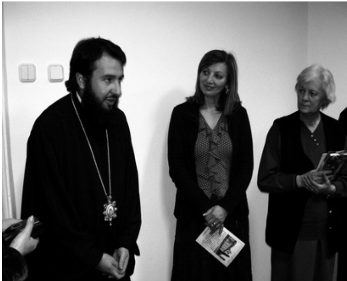
"Feminists" piously listening to a priest's teachings

Orthodoxy is keeping women silent, submissive and uneducated.