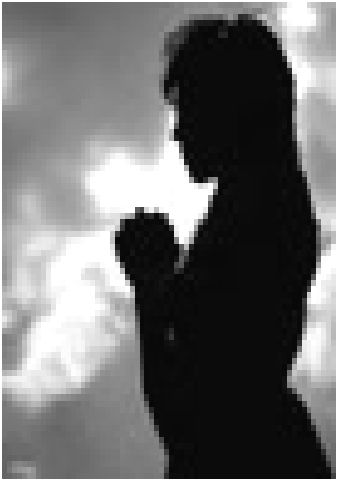
Unfortunate marriage between feminism and orthodoxy

Woman has to be regarded as an important social and political factor in the 'healthy' development of the nation, because women are the preservers of tradition and Romanian spirituality and the stable point in the societal and spiritual chaos (women are symbols of morality and pacifism and educators of the nation ).