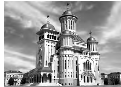
Project of Romanian People Salvation Cathedral

Romanian People Salvation Cathedral is a pharaonic project initiated by the former Patriarch of Romania in the '90s, the construction only started in spring 2008. The Cathedral can receive 6000 people inside, it has a library, a hotel for pilgrims and it is as well hosting the residence of the Patriarch. It is positioned next to the Palace of Parliament (previously named The House of People, it is the greatest second building in the world after the Penta-