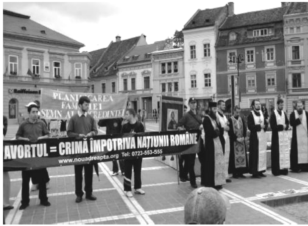
"Abortion= Crime against Romanian Nation" - campaign of BOR and Noua Dreapta

Another campaign where Noua Dreapta is holding hands together with BOR is the one against abortion. Both Noua Dreapta and the church are trying to deny women reproductive rights once again. After the dark age of dictatorship women gained the full right to abortion and reproductive control in 1990. In 1989, Romania's rate of maternal mortality (having as main cause the illegal abortion) was the greatest ever recorded in history of Europe. Some records show that between 1976 and 1989 more than 7280 women died because of