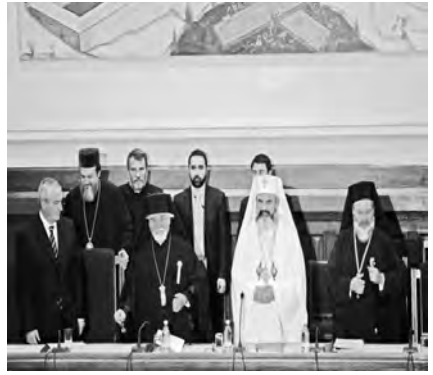
Prime Minister and heads of BOR

What the orthodox church is doing in fact is exercising pressure on the political actors, compelling them in adopting the church's objectives, masked under the pretext of patriotism and devotion to the people's wellbeing. The political ethics are considered to be the same with the moral-orthodox ones. The argument that the clergy is going to be present in the Parliament only for the benefit of it's parishioners [and by this it should be understood that the parishioners are the people], is accompanied by the one suggesting that the priest would perform a sort of exorcism, a sanctification of the political environment. Their electoral-confessional propaganda is highly based on the discourse of collectivity, nationalism and tradition, thus neglecting the human rights and freedoms of all the individuals living in Romania. The power that BOR is exercising over the legislative system is explained also through humble obedience of the political class to the orthodox pressure.