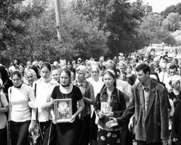
Orthodox women marching—led by a man

only because the child is female. The marriage has the aim of encouraging procreation (which later on will determine once more the filthiness of woman) and preventing debauch and harlotry. When she is getting married, the priest is teaching the woman "to submit to man, because man is the head of woman" and "to fear man". Thus woman is changing the authority she had been subjected to all her life, before the marriage - the one of the father, to the new one - the one of the husband. If the woman had sexual intercourse before marriage without the approval of the father, she is whore (harlot), and even after the marriage she will live under the sign of harlotry. As for the woman who is committing adultery, she will be sent away by her husband. The reciprocal situation is not valid, the woman is going to keep the man who is committing adultery.