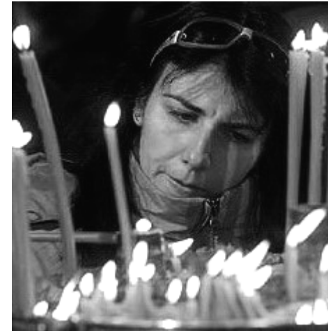
Orthodox woman in Church

The inferiority imposed on women for centuries is a direct result of the misogyny preached by the bible. The start point of this hatred towards women was the invention of "Eve's Myth" and from this point on the biblical texts are absurdly trying to prove the inferiority of women through lousy stratagems making use of the effect terror and fear have on human rationality. Fear and hatred of women were built on the devilish image of woman, the source of all misfortunes on earth, the evil in itself.