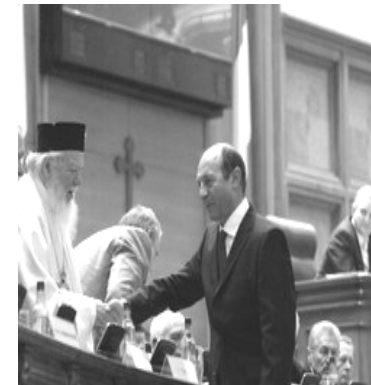
The president and the patriarch shaking hands in the Parliament room