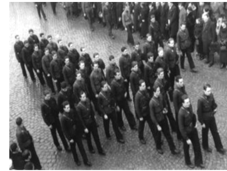
Iron Guard marching in cross

confusion) was representing the less radical wing of the legion and had the least Orthodox orientation. The Iron Guard allied with General Ion Antonescu, proclaimed the National Legionary State on September 6, 1940 and started a session of pogroms and political assassinations. The Iron Guard was seeking for full governing power and started the Legionary Rebellion in January 21, 1941. After 3 days civil war Antonescu supported by the German army defeated the Iron Guard, and proclaimed his own dictatorship. Horia Sima and the other heads of the Legionary Movement were forced to seek refuge in Nazi Germany. Under Antonescu Government, Romania joined the Axis Powers for most of the World War II. In August 1944 King Michael led a coup and deposed Antonescu dictatorship getting on the side of the Allies for the rest of the war. The aftermath of WWII placed Romania under Soviet occupation. The orthodox hierarchs, priests and students were actively supporting the legionnaires not only because of their overt religiosity but also for sharing the same "enemies" (the communists, the Jews, other religious and ethnic minorities) and had a high contribution in the pogroms led by the Iron Guard in 1941.